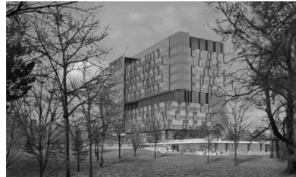
Architects rendering of new hospital, Opening 2012