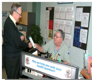
A volunteer helps a patron at the Trillium Health and Information Wellness Centre.

Consumer Health Information and CHIPIG 1