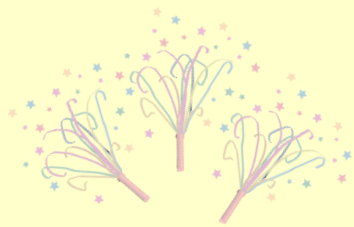
Exhibit Hall Details

Exhibitor Setup: Tuesday, June 2: 2:00 pm to 6:00 pm